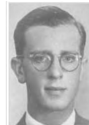
Marcial Maciel Degollado