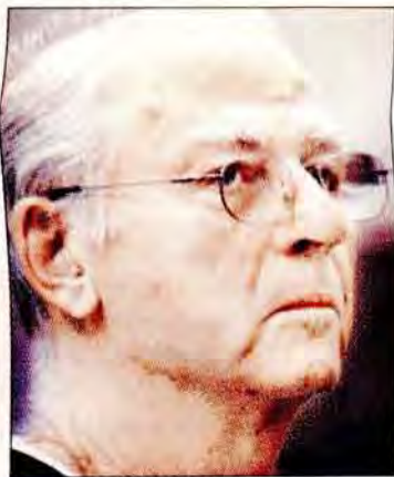
PAUL SHANLEY the face of clergy sex abuse